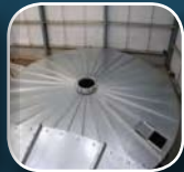
Flat Roof Silos

Tel: +44(0)1724 282 828 Fax: +44(0)1724 280 021 sales@bentallrowlands.co.uk www.bentallrowlands.co.uk