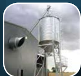
Splayed Leg Silos