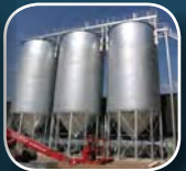
Smooth Wall Silos