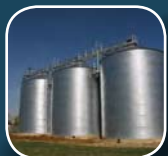
Flat Bottom Silos